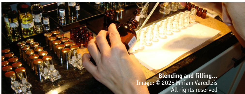
Blending and filling... Image: © 2025 Miriam Varedzlis All rights reserved

In the 8+ years since I launched the company, the collection has grown to 22 Accords across 18 olfactive families. Our very first orders shipped internationally and, to date, have landed in nearly 20 countries, and now live within the formulations of countless brands and perfumery collections across the world.