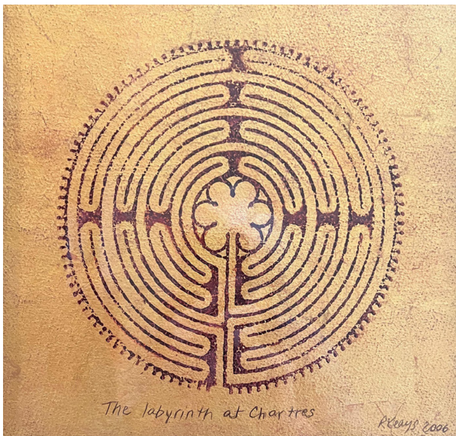
< "The Labyrinth at Chartres" A gift to Miriam painted by R. Keays Image: © 2025 Miriam Vareldis All rights reserved >

In fact, even I took advantage of those couple of downturn years of the housing crisis and gave myself permission to create and launch my own 'Indie' perfume line, 40notes Perfume , in 2010,