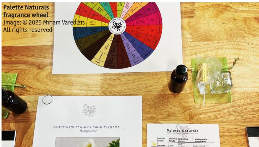
Palette Naturals fragrance wheel